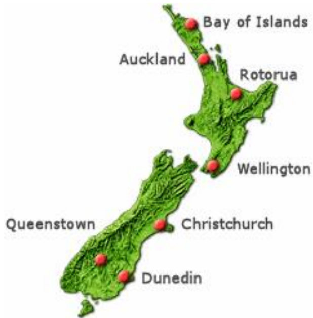
Figure 1: Tourism Locations in New Zealand