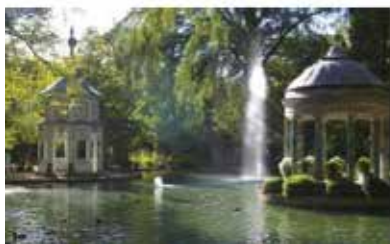
>>ARANJUEZ Royal Palace Gardens