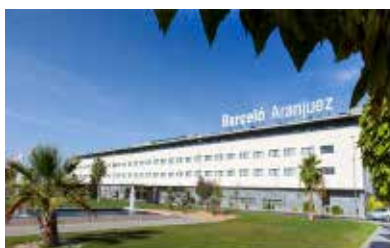
>>BARCELO HOTEL The Hotel

Credit Cards accepted: Visa, MasterCard, American Express and Eurocard.