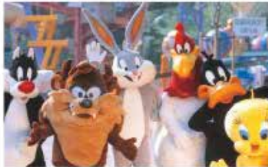
>>MADRID Warner Bros