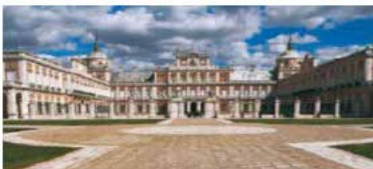
>>ARANJUEZ Royal Palace