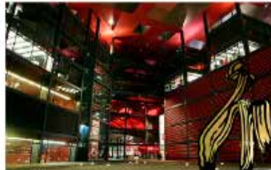
>>MADRID Reina Sofia Museum