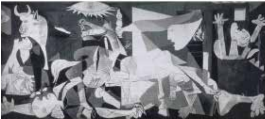
>>MADRID Guernica. Picasso