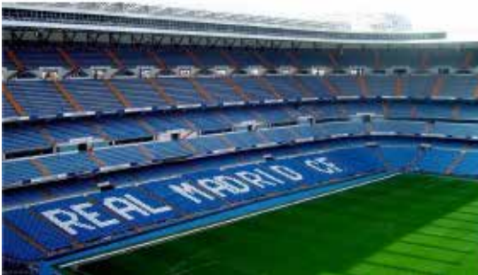
>>MADRID Real Madrid Stadium