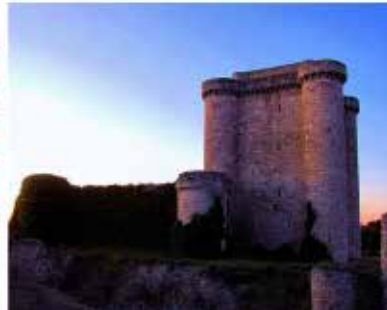
>>SESEÑA Castle Puñonrostro