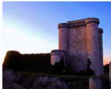
>>SESEÑA Castle Puñonrostro