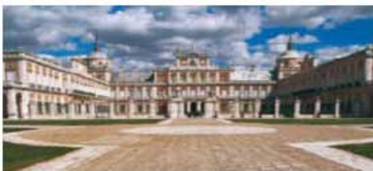
>>ARANJUEZ Royal Palace