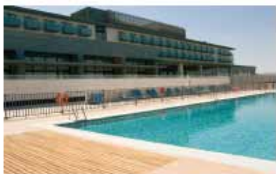
>>BARCELO HOTEL Outdoor pool