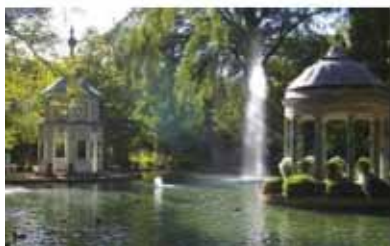
>>ARANJUEZ Royal Palace Gardens