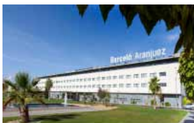
>>BARCELO HOTEL The Hotel

Credit Cards accepted: Visa, MasterCard, American Express and Eurocard.