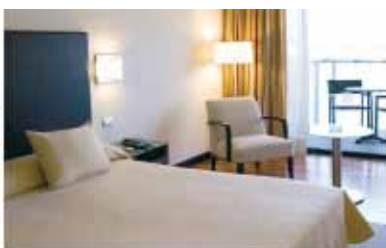
>>BARCELO HOTEL Bedroom