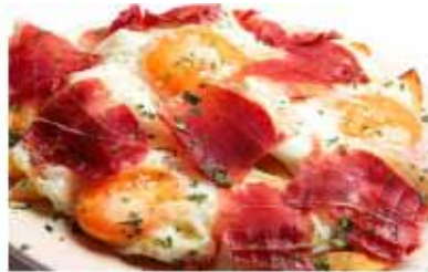
>>MADRID Tapas Food