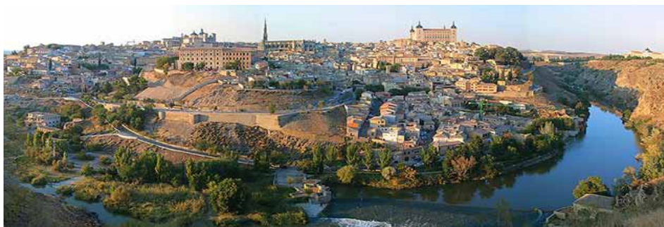
>>TOLEDO Panoramic View of the town

More surroundings can be found at Sesena Waterski & Wakeboard Complex web: http://www.botaski.com/surroundings/