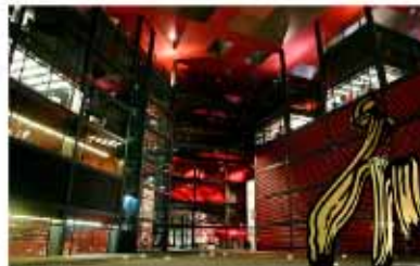
>>MADRID Reina Sofia Museum