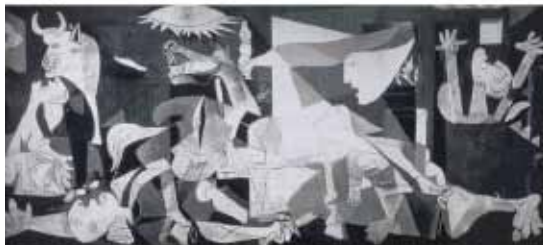
>>MADRID Guernica. Picasso