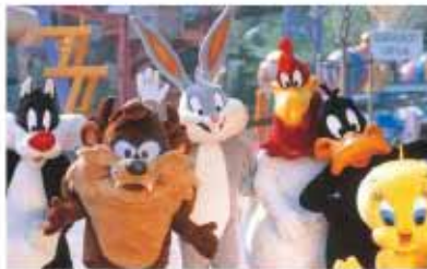
>>MADRID Warner Bros