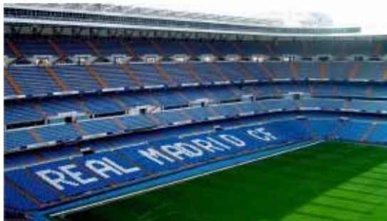
>>MADRID Real Madrid Stadium