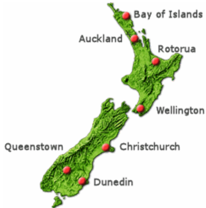
Figure 1: Tourism Locations in New Zealand