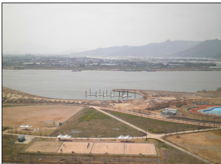
Hwamyung Eco Park

Korea Waterski & Wakeboard Association Welcomes All Countries to Participate in the 2013 Busan IWWF World Wakeboard Championships at Hwamyung Eco Park in Busan from August 28th to September 1st, 2013.