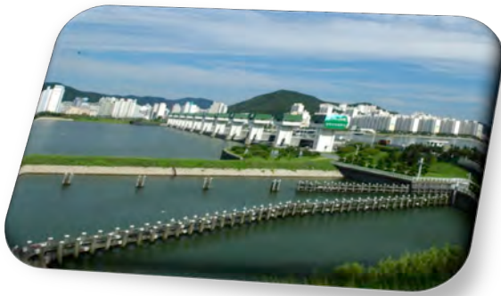
(Eulsookdo Island in Nakdong River)