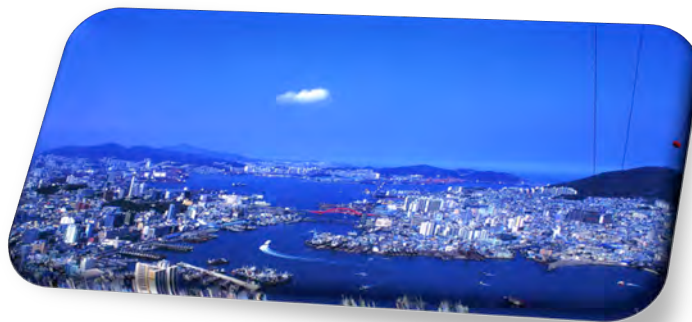
(Landscape of Busan Metropolis)