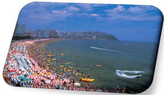
(Haewundae Beach well-known worldwide)